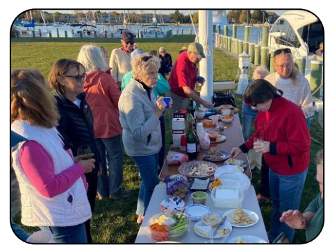
Evening Parties and Socializing Activities