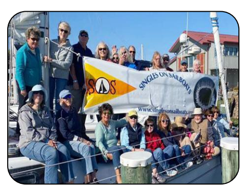
Group Photo on S/V 'At Last'