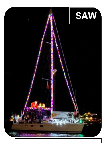
SOS Boat Entry