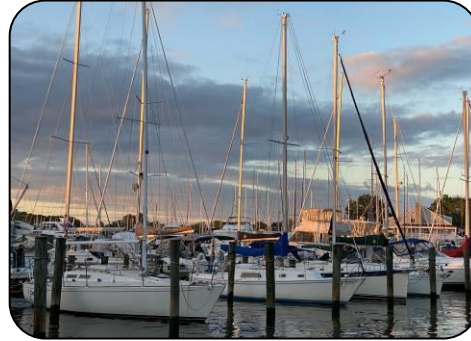
SAILBOATS - 2 nd PLACE Samia AbdelWahed