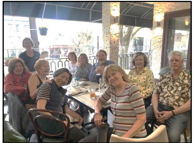
NVDC Happy Hour- April 2021

4 th Thursday ANNAPOLIS: May 27 nd 5:00-7:00 PM THE PIER 48 South River Rd, Edgewater, MD. Rt. 2 on south side of South River Bridge. If we not in the bar area, will be on UPPER deck outside. 443-837-6057 cocojoes@comcast.net CONTACT in SOS: repace@msn.com