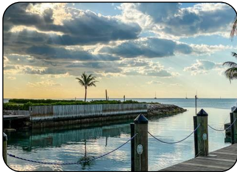
DESTINATION CRUISES - 1 st PLACE: Nancy Parsons