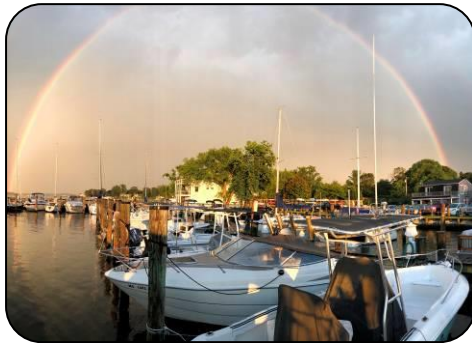
BAY SAILING - 2 nd PLACE Andy Katz