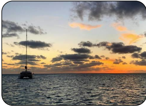
DESTINATION CRUISES - 1 st PLACE: Sandy Rosswork