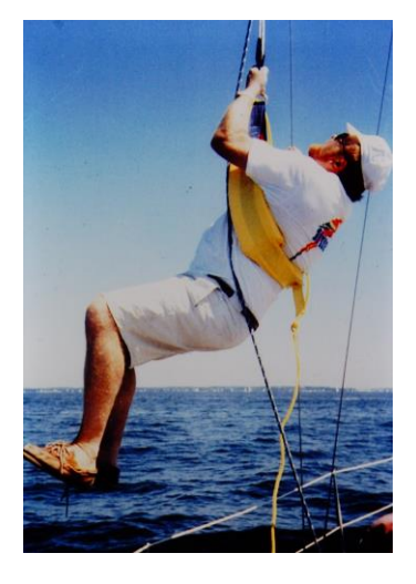
Man Overboard Drill