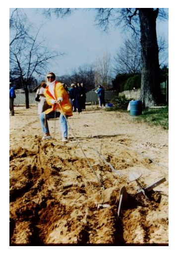
Flare Demo Day: Learning how an anchor is set