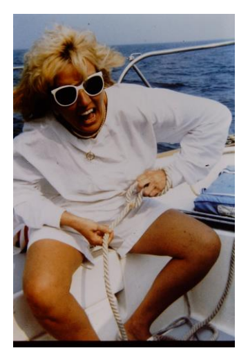
Practice, practice, and more practice tying those knots

Recently some 1980s-1990s photos of SOS activities came to light. It is interesting to see that some of the activities in which members were participating are the same we do now! Just shows when an organization does something well, it is repeated!