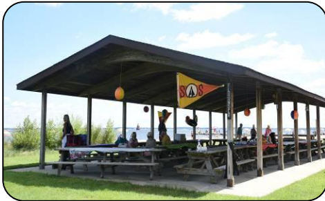
Beach Party Site (SAW)