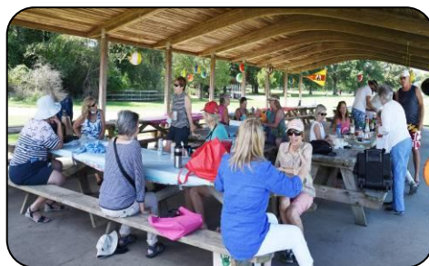
The Gathering-3 (SAW)