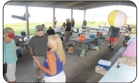
The Gathering-2 (GVW)