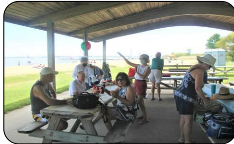
The Gathering-1 (GVW)