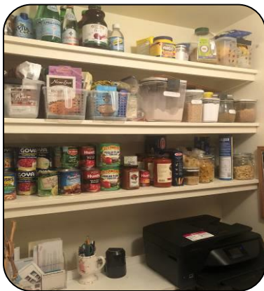
↔ Lorraine Panaccio organized her pantry