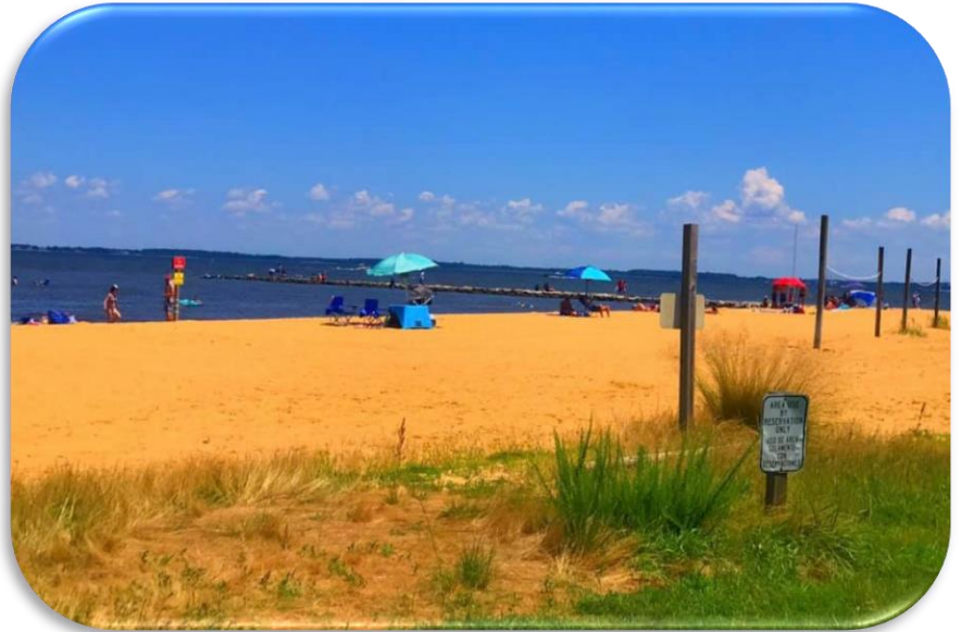
The beach at Sandy Point State Park