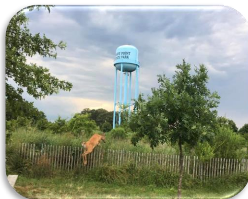
Wildlife at Sandy Point State Park