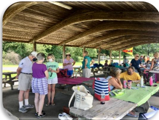
Party in the Pavilion