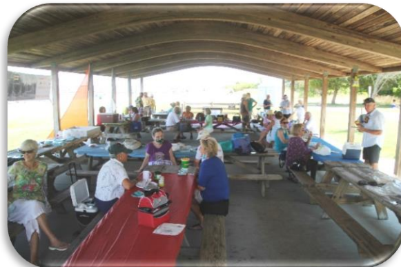
Pavilion at Sandy Point State Park