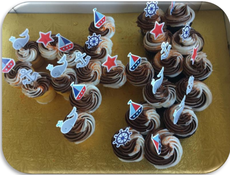
Anniversary Cupcakes