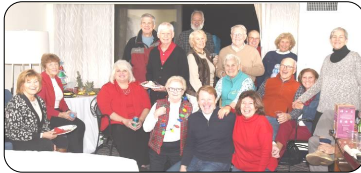
SOS Group Photo (SAW)