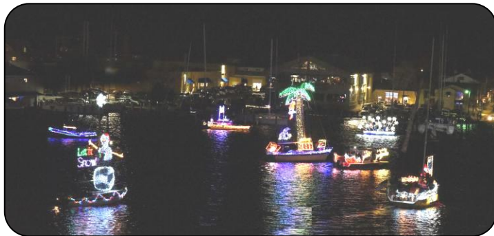
Group 1 of Lighted Boats (SAW)