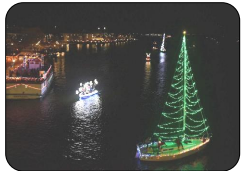
Group 2 of Lighted Boats (SAW)