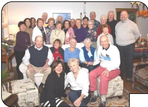
Group Photo (SAW)