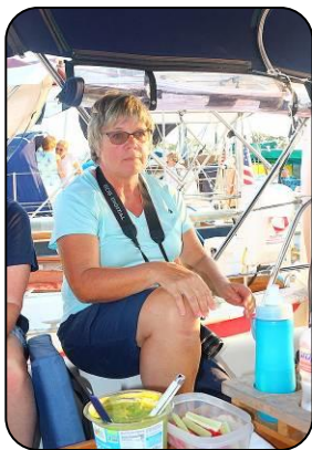
Whisker Pole