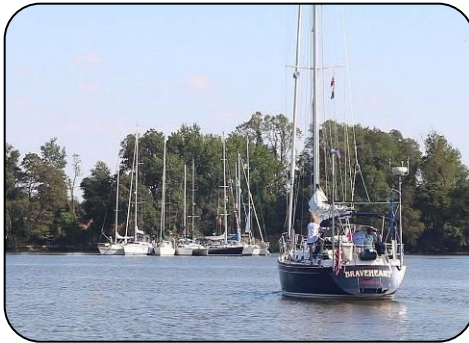
s/v BRAVEHEART approaching the raft-up (RAG)