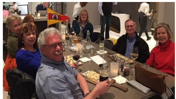
Rockville Happy Hour

4 th Tuesday Date Change November Only ANNAPOLIS: Nov. 26 th 5:00-7:00 PM THE PIER 48 South River Rd, Edgewater, MD If we are not in the bar area, we'd probably be on the UPPER deck outside. 443-837-6057 (still cocojoes@comcast.net) CONTACT: repence@msn.com 301-717-2770