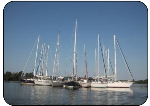
The Raft-Up (GVW)