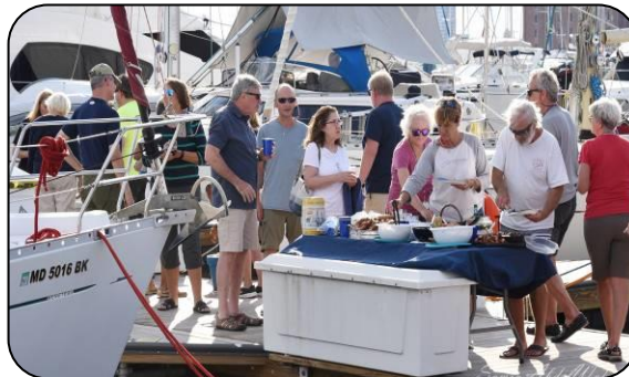
Happy Hour on the dock at Anchorage Marina