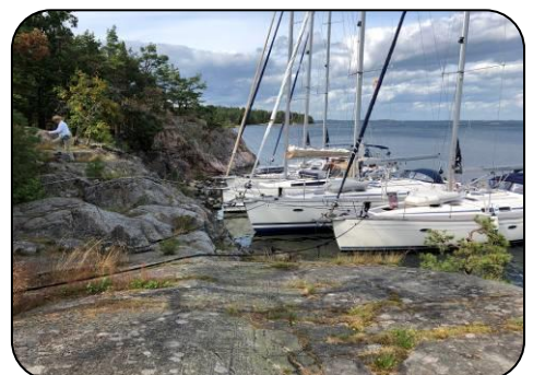
ANCHORING IN SWEDEN (MS)