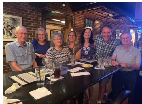
Ellicott City Happy Hour

4 th Thursday ANNAPOLIS: Oct. 24 th 5:00-7:00 PM THE PIER 48 South River Rd, Edgewater, MD If we are not in the bar area, we'd probably be on the UPPER deck outside. 443-837-6057 (still cocojoes@comcast.net) CONTACT: repence@msn.com 301-717-2770