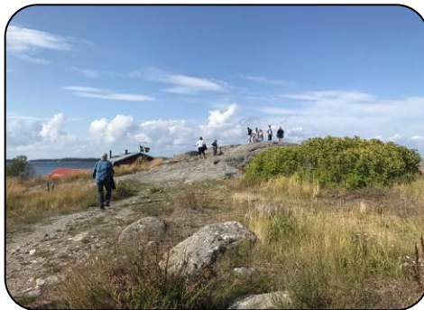
EXPLORING THE HILLSIDE