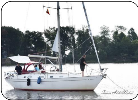
s/v VALIDITY (SAW)