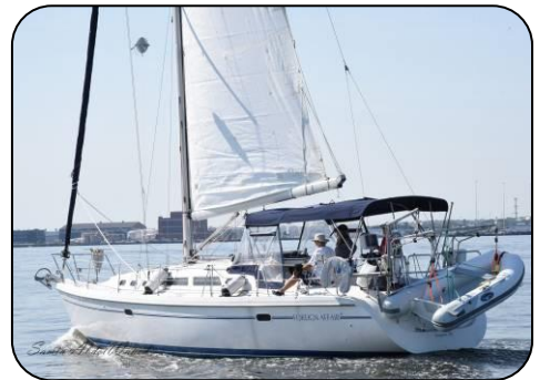
s/v FOREIGN AFFAIRS