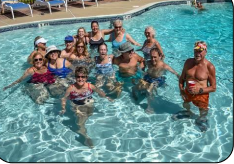
Group Swim (JRP)