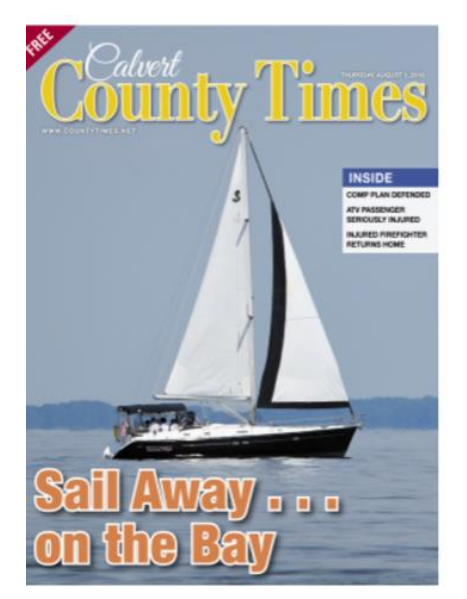
Calvert County Times 01 August 2019

Bob Morrow has a new job as captain of a sailing sightseeing boat with Chesapeake Windsail Cruises out of Chesapeake Beach. The 42' Beneteau Eternal Hope, was featured on the cover of the Calvert County times.