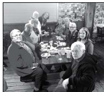
NEW Delaware Beaches Happy Hour

ANNAPOLIS: May 23 rd 5:00-7:00 PM New location for this month is THE PIER 48 South River Rd, Edgewater, MD If we are not in the bar area, we'd probably be on the UPPER deck outside. 443-837-6057 (still cocojoes@comcast.net) CONTACT: repace@msn.com 301-717-2770