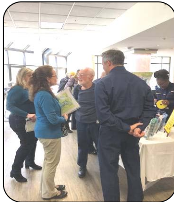
SOS members using the USCG Resource