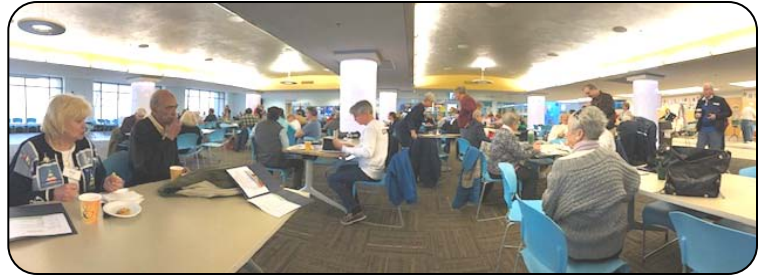
Break time Gathering-2