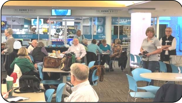
Break time Gathering-1