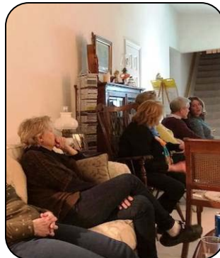
Experienced SOS Members explain and share with New Members