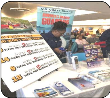
US Coast Guard Resources