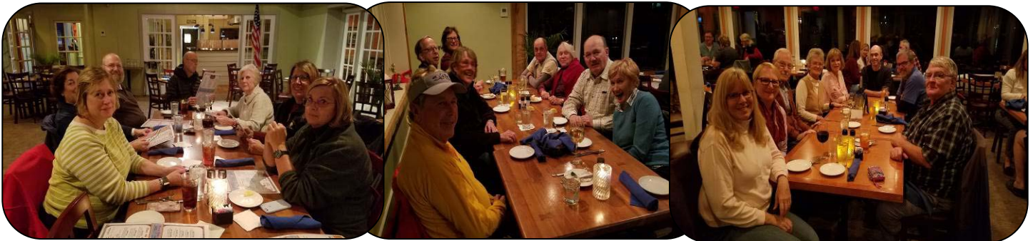
Dinner photos: Too many names to list. . . . (TS)