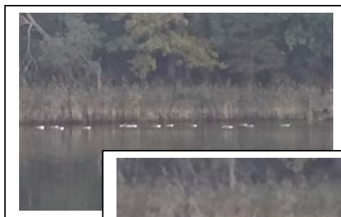
The Canada Geese (CCF)