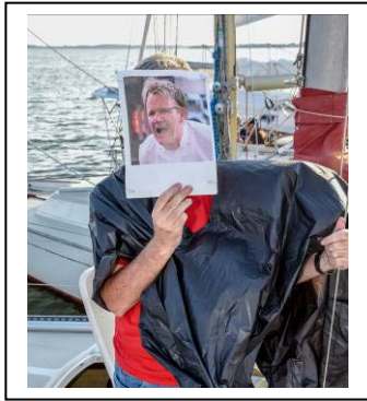
Celebrity Chef Judge: Gordon Ramsay