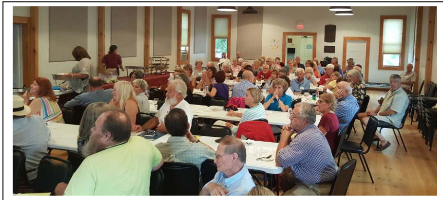
Meeting Time (RAW)