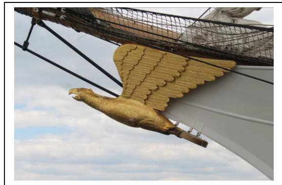
The Eagle used to carry the German insignia, now carries the USCG emblem.