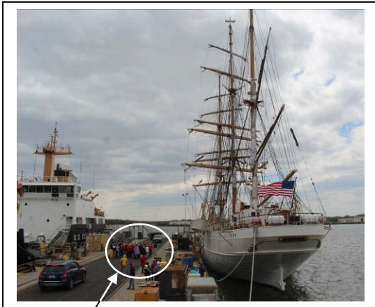
SOS Group preparing to go aboard.