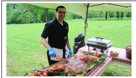
Adam's Ribs serving up the Pig Roast.