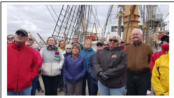
SOS Group listens to the history and description of the USCG Barque Eagle.