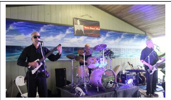
Motor Driven Band provided the music.

NOTE FROM PHOTO EDITOR: Please include names with your photos so we can learn everyone's names.