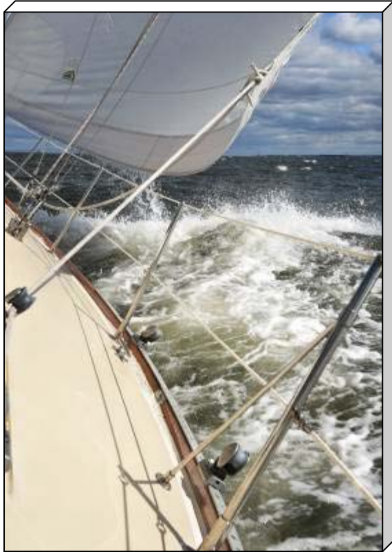
GRAND PRIZE and 1 st Place – SAILBOATS Samia AbdelWahed