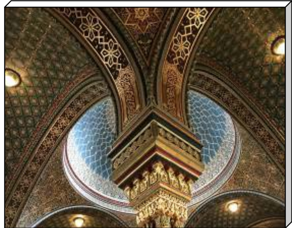
1 st Place – PLACES Aletta Schaap